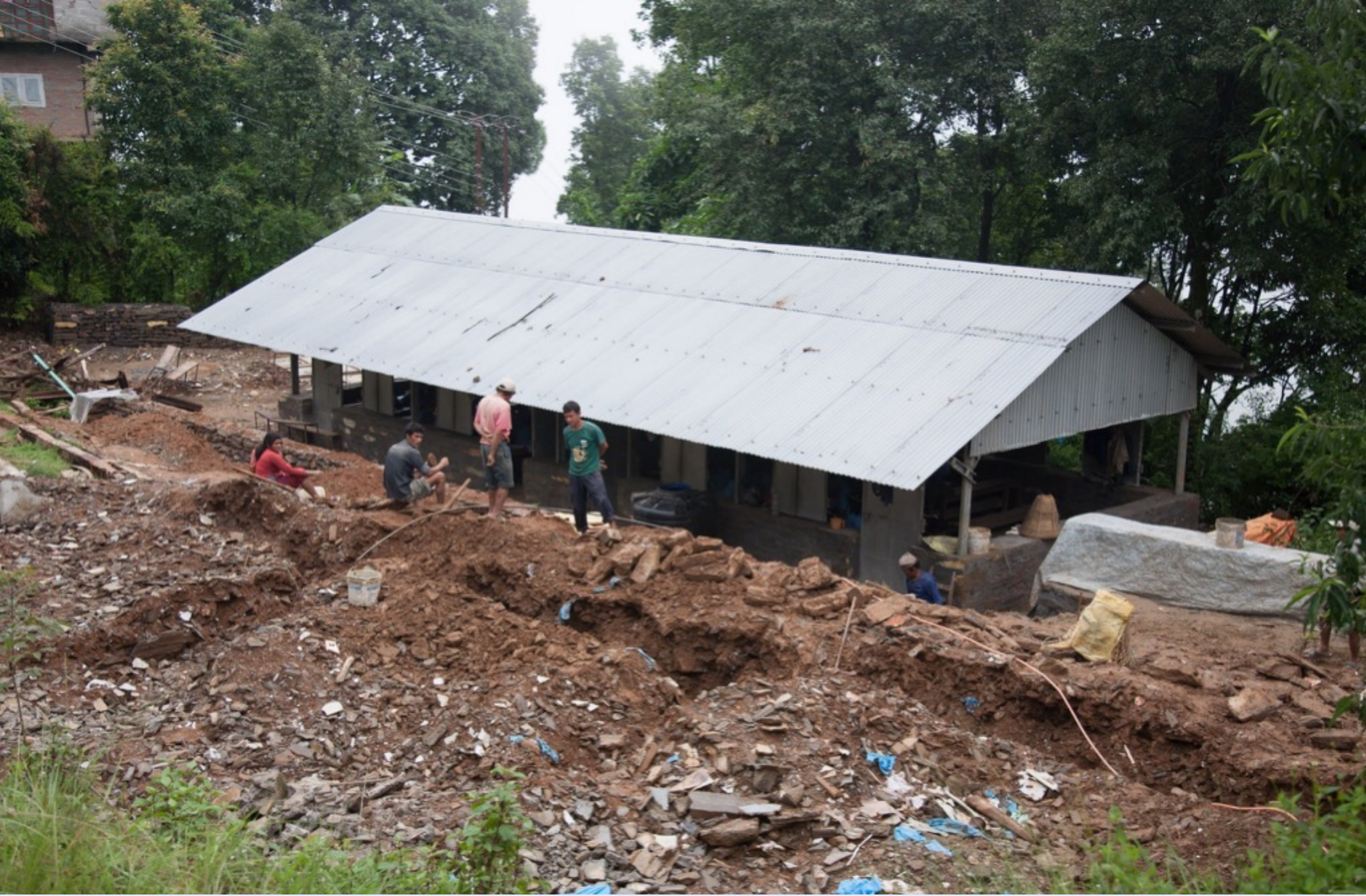
Seti Devi SS School 40% buildings damaged or destroyed - note Steel Truss standing