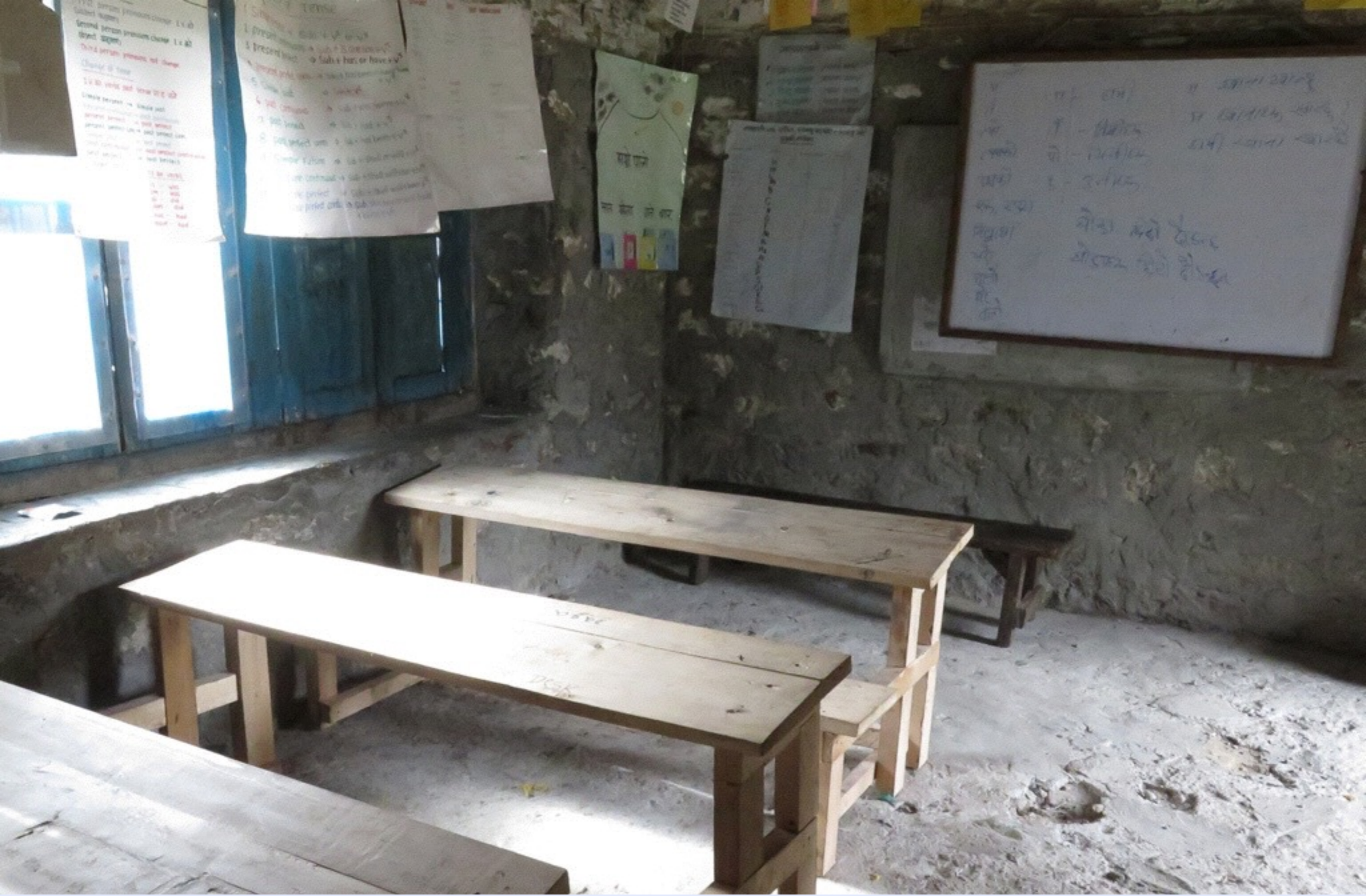
Ghunsa School Classrooms very cold and dark - most time spent outside...