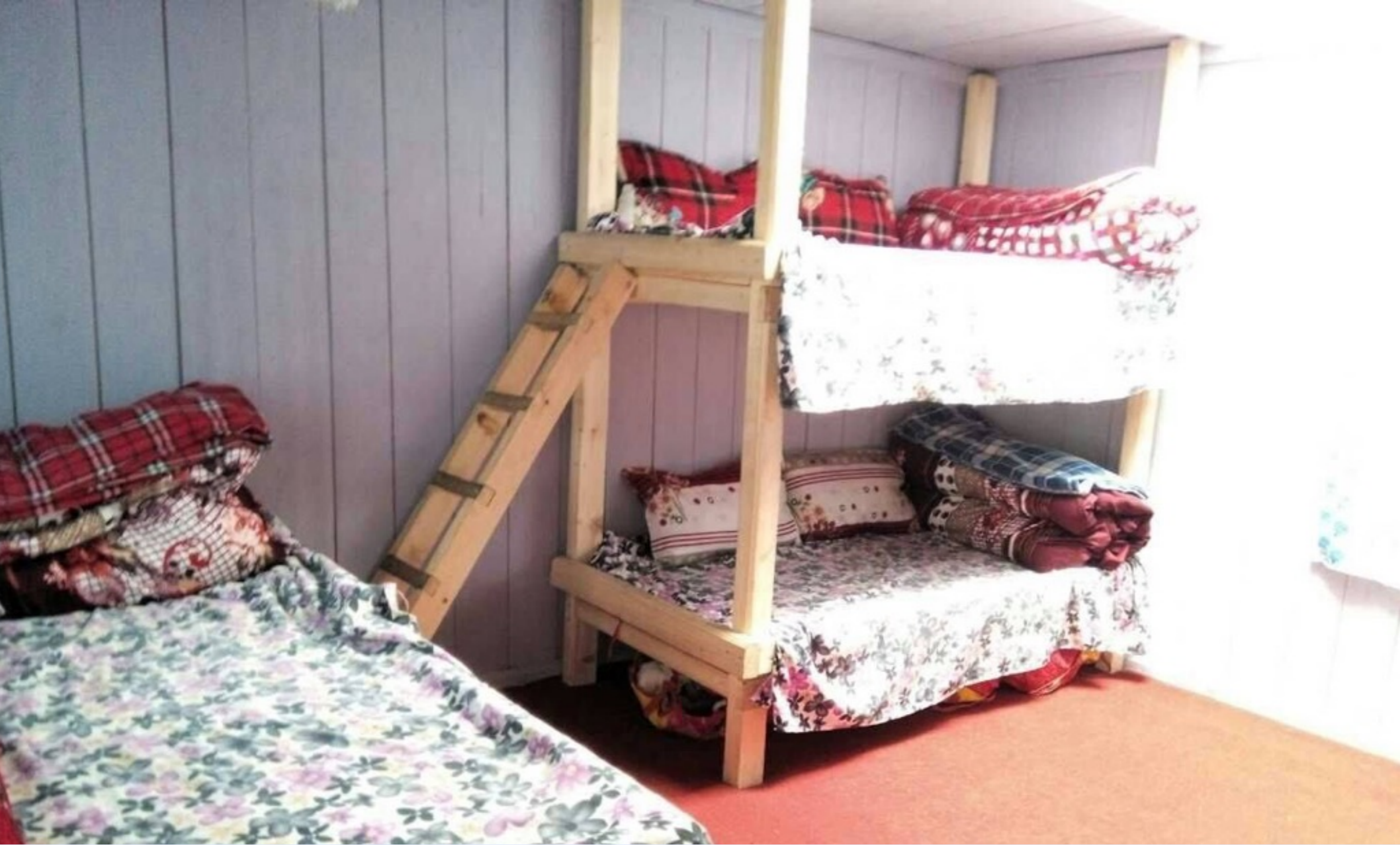
New Hostel Established in school Teaching staff moved out to Village accomodation