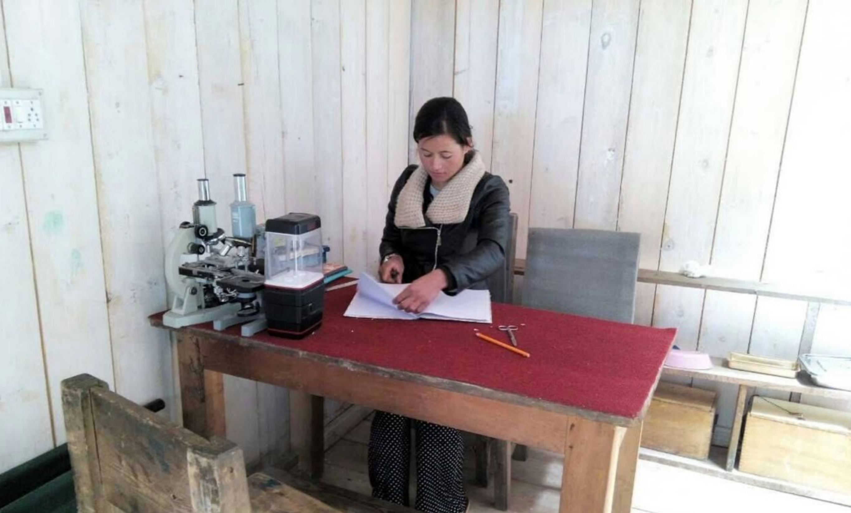
New Health Post established HDFA lobbied for government funded Nursing staff commenced 2015