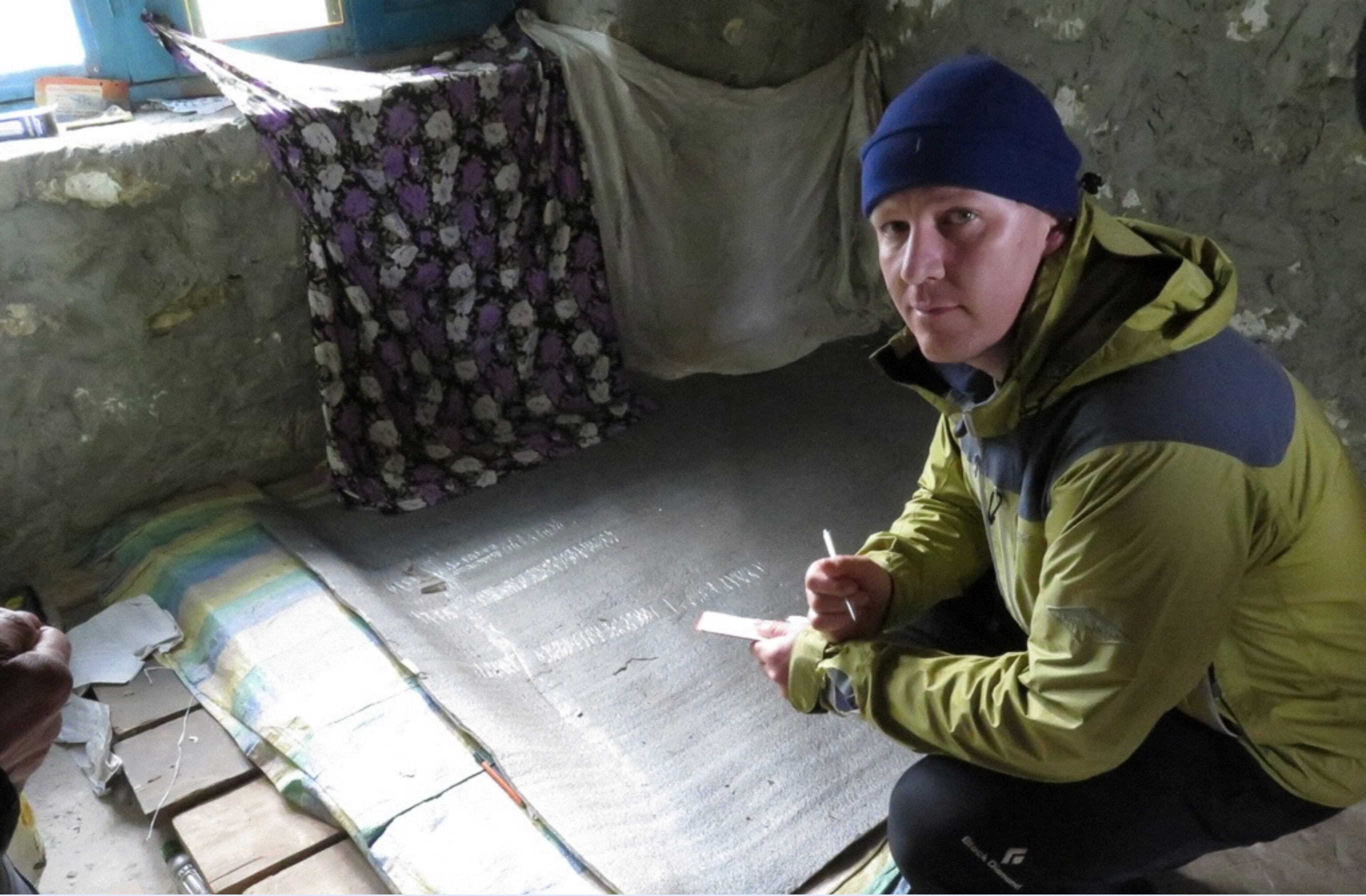
Ghunsa School room converted to “hostel” (visit 2013) 8 children slept on this one “mattress” little supervision