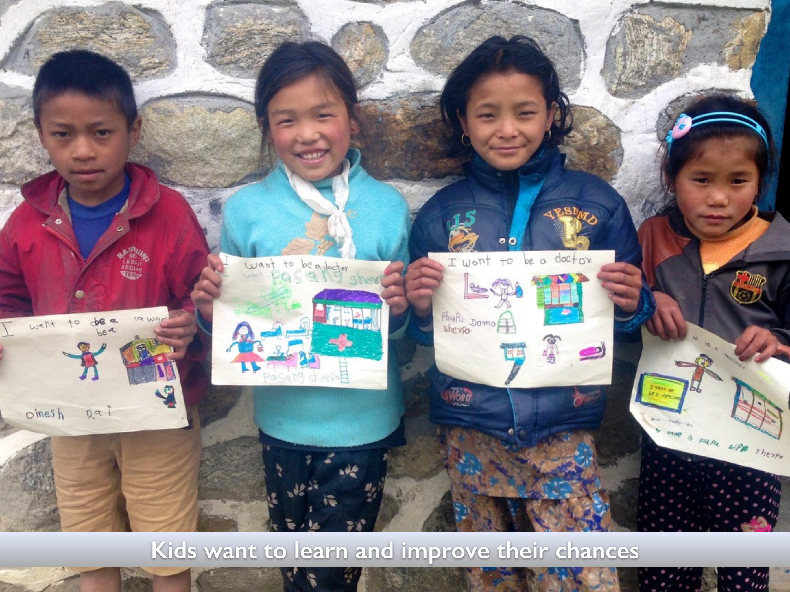
Kids want to learn and improve their chances