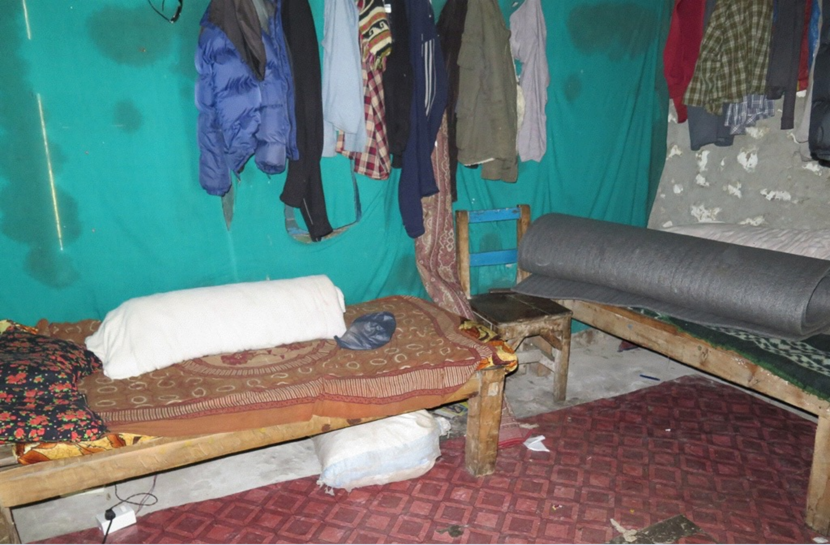
Teachers living 3-4 to a converted classroom supervising hostel & teaching 24x7, very tiring, teaching quality drops