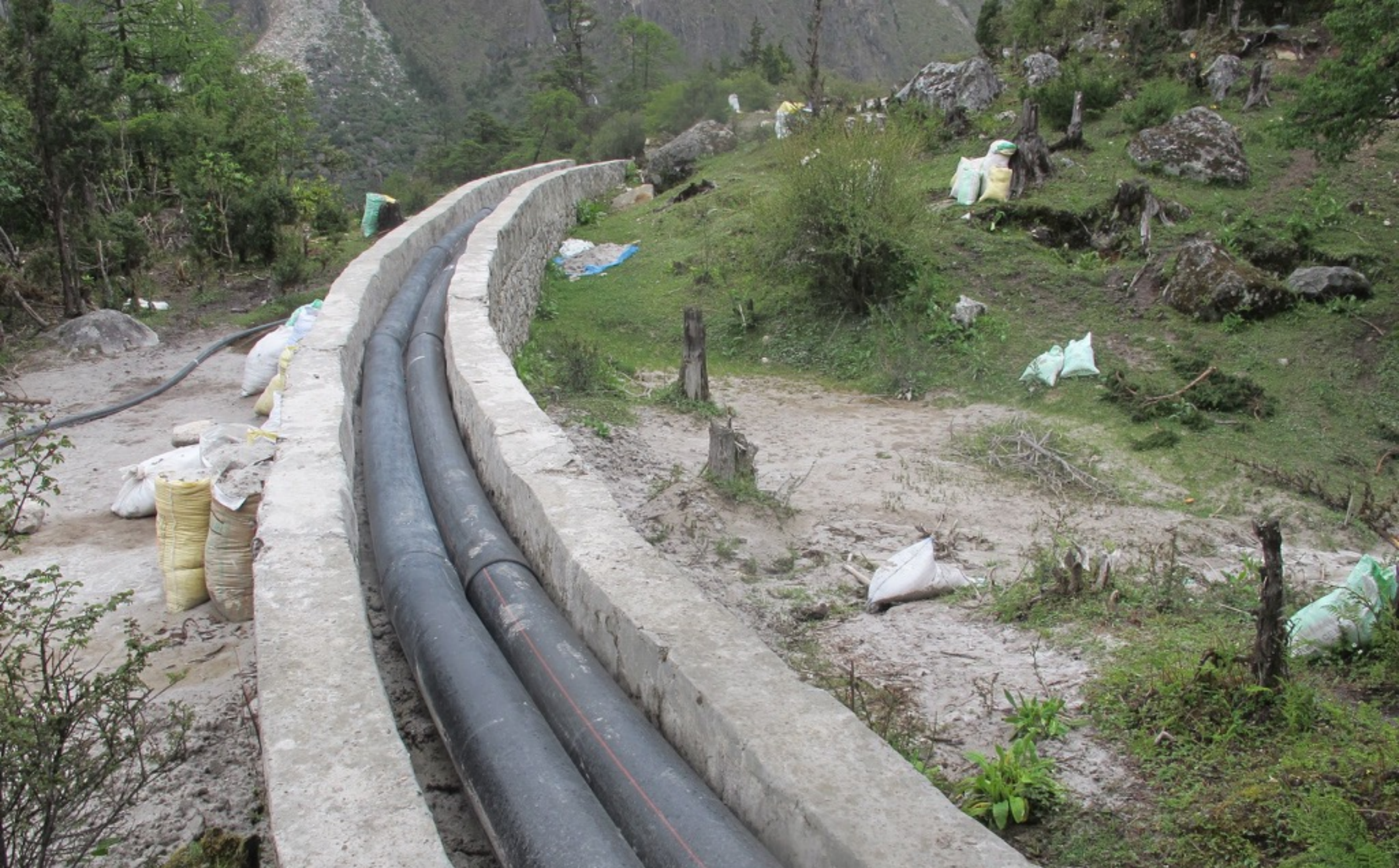
Earthquake Damaged Hydro Scheme - Repaired 2015