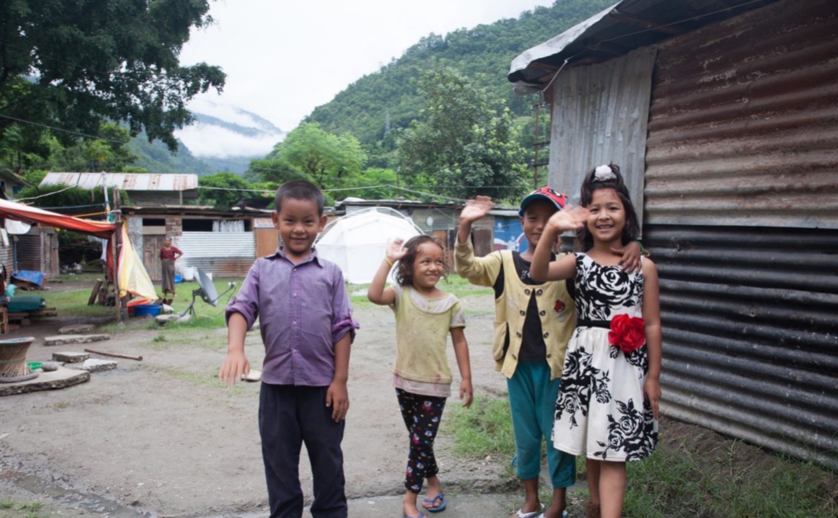
Child Safety at higher risk post earthquake